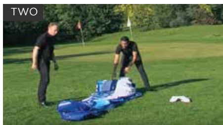
TWO Roll out the marquee.