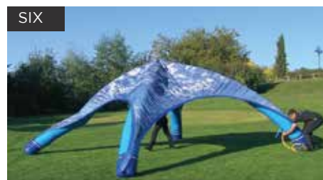
SIX During the inflation process raise legs into the center until all legs are upright.