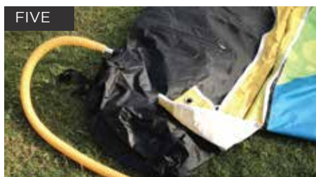
FIVE Connect the pump to selected Inflation Valve and begin inflation.