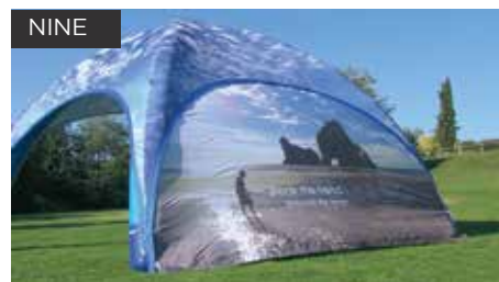
NINE Ensure all walls are lined up and firm.