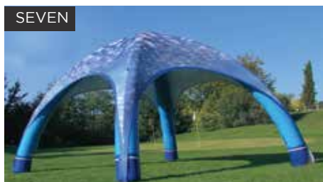
SEVEN Ensure all legs are lined up and roof is centered. Check frame is firm.