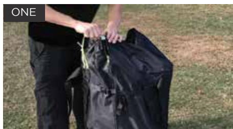
ONE Unpack the marquee.

Recommended procedure below. For safety reasons it is recommended that 2 persons set up any marquee. Ensure area is free from any sharp objects & overhead objects.