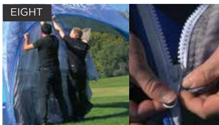
EIGHT Marquee Attachment* Attach your Walls and Awnings using zips.