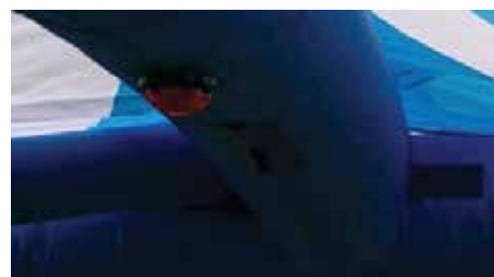
Over pressure relief valve system, DO NOT TOUCH.

When the marquee is in use, do not leave your marquee unattended.