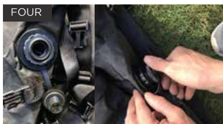
FOUR Each leg on the marquee has a valve. Select valve to attach pump, screw inflation valve closed and leave cap off. On all other valves screw tight and fix cap.